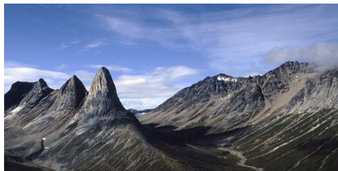
Figure 4: Natural rocky mountain

Selfridges Building in Birmingham, by architect Jan Kaplicky, founder of Future Systems, features a curvy space-age design that epitomizes what the aesthetic goal of bionic architecture is all about. His idea was to combine the organic and natural forms with high technology to achieve the optimization. Completed in 2003, it remains one of the leading forward-thinking buildings out there.