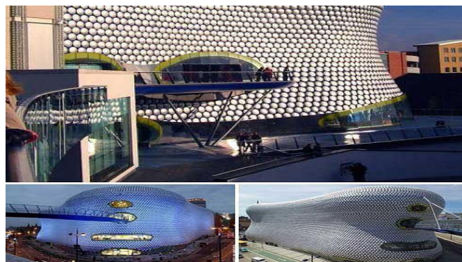
Figure 5: Bullring in Birmingham done by Jan Kaplicky

Selfridges Building in Birmingham, by architect Jan Kaplicky, founder of Future Systems, features a curvy space-age design that epitomizes what the aesthetic goal of bionic architecture is all about. His idea was to combine the organic and natural forms with high technology to achieve the optimization. Completed in 2003, it remains one of the leading forward-thinking buildings out there.