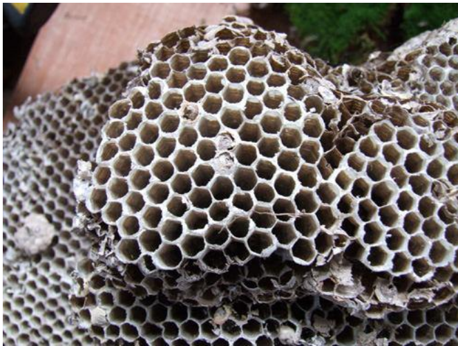
Figure 6: Wasp nest structure

Floating House in created by Robert Oshatz Inspired by Nature, Taking inspiration from ocean, the end result sits in harmony with its surroundings. Oshatz is known for his curvaceous, swooping architecture and unique approach to design. Since active construction is prohibited on the Willamette, Oshatz had to construct the home off-site on the connected Columbia River and pull it by barge to its mooring. This unique home is kept afloat by locally sourced 80-foot Douglas fir logs, and the exterior design takes its cue from ocean waves.