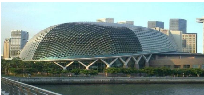
Figure 2: Exhibition hall inspired from turtle shell

Denver International Airport is another example of this kind of architecture. Denver The tensile fabric roof of this building is designed by inspiration from the naturally occurring beauty of the Rocky Mountains. As the largest airport in the United States, it reflects a mixture of historic and modern architecture.