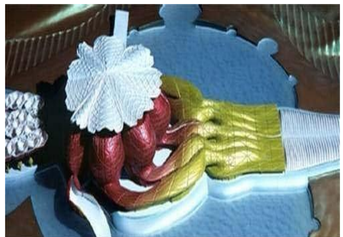
Figure 8: Costa Rica done by Greg Lynn

Ark of the World, Costa Rica is the example of inspired design. The buildings created by Greg Lynn are based on a type of architecture for which he coined the term 'blobitecture'. This type of building relies on the 'blob-like' shapes of amoebas and other naturally occurring forms to create the basic bulbous (rounded) design of the buildings. One of the best examples of this is his plans for the Ark of the World, a building located in the Costa Rican rainforest which is planned to serve as an eco-center and location of eco-education.