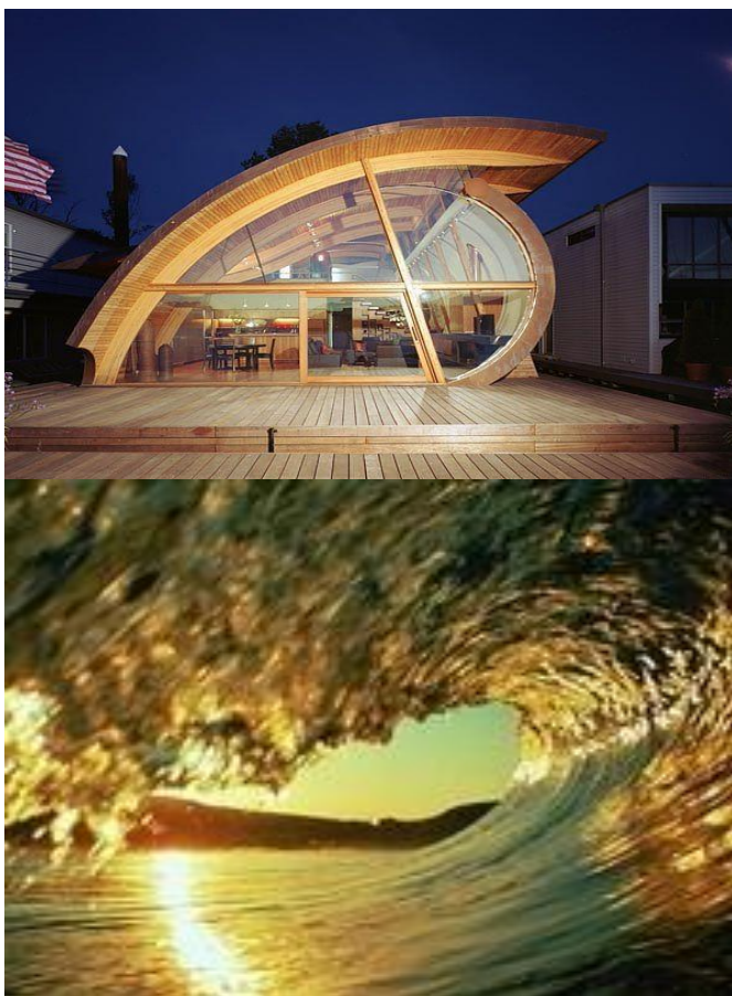
Figure 7: floating House and its natural concept

Floating House in created by Robert Oshatz Inspired by Nature, Taking inspiration from ocean, the end result sits in harmony with its surroundings. Oshatz is known for his curvaceous, swooping architecture and unique approach to design. Since active construction is prohibited on the Willamette, Oshatz had to construct the home off-site on the connected Columbia River and pull it by barge to its mooring. This unique home is kept afloat by locally sourced 80-foot Douglas fir logs, and the exterior design takes its cue from ocean waves.