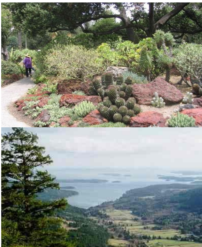
Figure 10: irregular pattern of outdoor spaces

Beijing Olympic Stadium, by Swiss architects Herzog and de Meuron houses a 91,000-seat arena under its 12-metre-deep steel exoskeleton, Inspired by Bird Nest because of its tightly woven lattice structure.