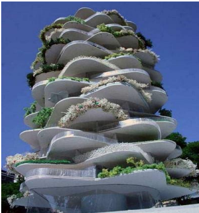
Figure 9: Urban Cactus in Rotterdam

harbor give it the semblance of bionic architecture and of course it's interesting and curvy aesthetics make it an appealing building. However, it's not 100% green or sustainable; therefore it only gets an honorable mention on most bionic architecture lists.