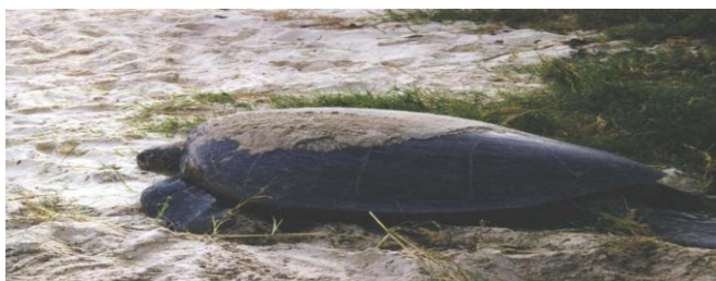
Figure 1: turtle shell in nature

For example a picture of sea turtle shell can be used to shape a reinforced concrete for a large span roof structure in an exhibition building. Unfortunately, it requires the involvement of a human designer who knows structural engineering and the theory of elastic shells, and who is able, most importantly, to avoid using inspiration in a wrong context. In such a case, a visual can be incorrectly to produce a dangerous design. For example, the use of the same sea turtle shell shape (Figure 6.1) to design a shear wall in a tall building may result in a structure excessively sensitive to large vertical forces and may be ultimately dangerously unstable.